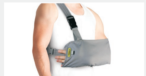
OAPL Shoulder Immobiliser